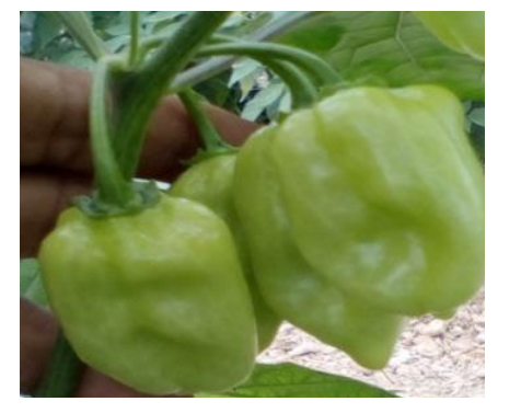
340 Plants Average fruits per plant 7.48 Average weight fresh 13.69 gr. per fruit Number of fruits per Kg. 73 Total yield 34.8 Kg.